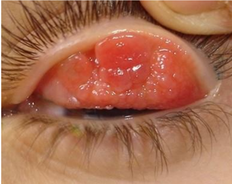
Fig. 2: Large conjunctival papillae on the underside of the upper eyelid of a patient with vernal conjunctivitis.

conjunctivitis is more difficult to treat than other types of allergic conjunctivitis, and may need special immune based medications such as cyclosporine drops to control the eye inflammation and prevent other eye problems. However, most patients eventually do grow out of this problem.