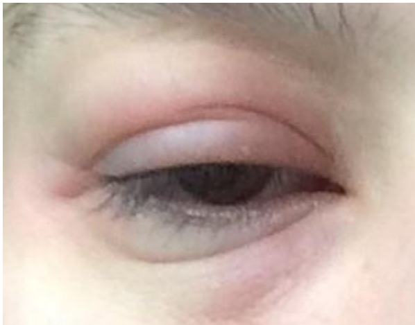
Figure 2. Swelling and redness of one or both eyelids may accompany allergic conjunctivitis.