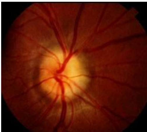
Fig. 2: Optic nerve with drusen.