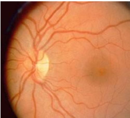
Fig. 1: Normal optic nerve.

The pictures below show the appearance of the optic nerve as seen by your ophthalmologist. The optic nerve is the round, yellow/pink area with the blood vessels coming out from the center. Figure 1 shows a normal optic nerve. Notice that the optic nerve is circular with sharp edges. Figure 2 shows an optic nerve with drusen. This nerve looks pushed forward with “bumpy” edges that are blurry, not sharp.