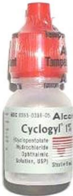
Fig. 2: Cyclopentolate (Cyclogyl), a commonly-used dilating eye drop that makes the pupil large and relaxes the eye's ability to focus.