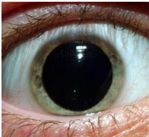
Fig. 1: Photo of an eye with a dilated pupil.

Dilating eye drops make the pupil of the eye bigger. The pupil is the black circle in the center of the colored part of the eye (iris) [See Figure 1]. There are two main types of drops that work on the pupil. One type makes the pupil bigger (dilation). The other type relaxes the eye's ability to focus (cycloplegia)[See Figure 2]. All these changes to the eye are temporary, and usually last for a short amount of time (see "How long do dilating drops last?" below). The two kinds of drops are usually used together, either as two separate drops, as a single combination drop, or as a spray.