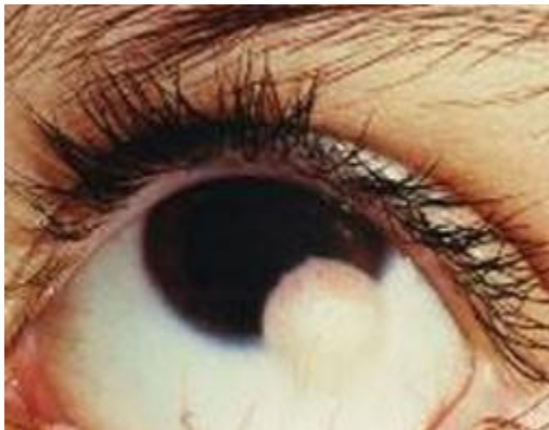
Fig. 2: Limbal epibulbar dermoid.

Limbal dermoids are found on the surface of the eye either on the cornea (the clear shield on the front of the eye) or where the cornea meets the sclera (the white part of the eye) [See figure 2].