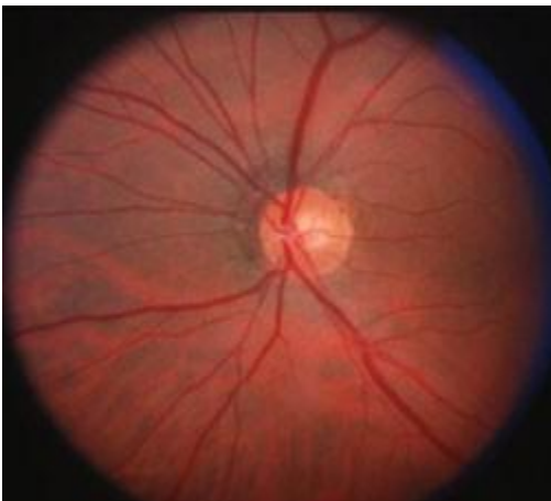
Fig. 1: Normal optic nerve.

The optic nerve is a nerve in the center of the back of the eye. The optic nerve itself carries over one million nerves that connect the retina (the part of your eye that has cells that collect light and sends a signal to your brain) to the occipital lobe (the part of the brain that interprets vision) like a cable wire. When your ophthalmologist examines your retina, what they see is a pink/orange circle with a yellow/white center, that is the optic nerve. (see Figure 1)